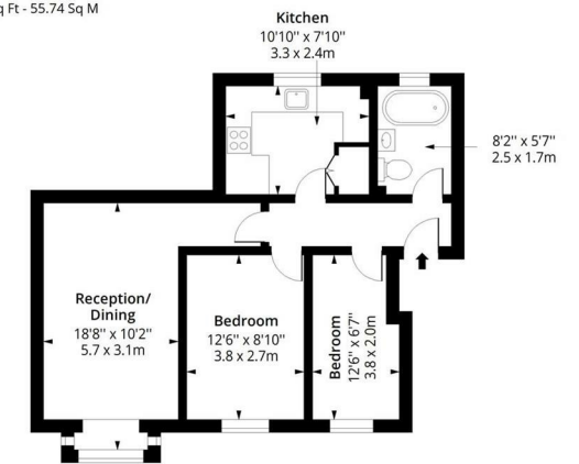
First Floor Floor Area 600 Sq Ft - 55.74 Sq M